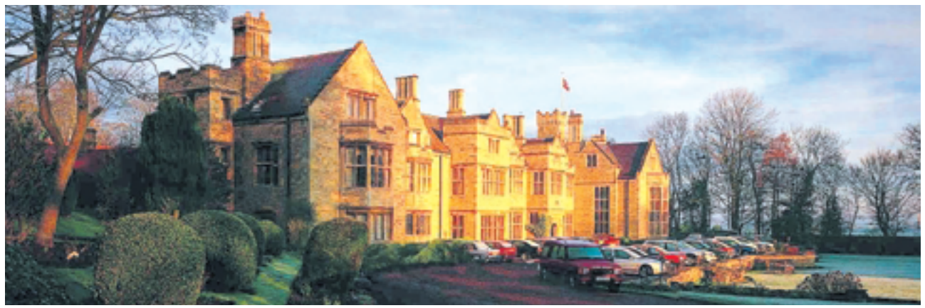
Redworth Hall Hotel, County Durham.