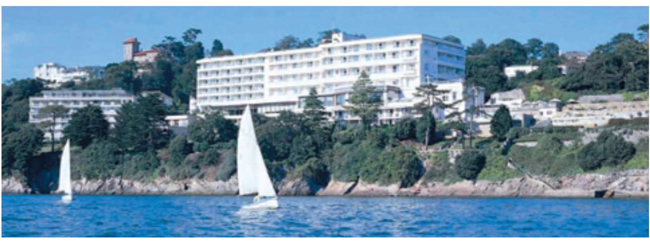
The Imperial Hotel, Torquay.