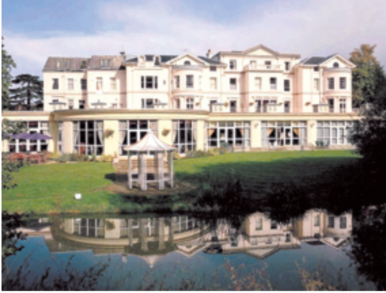
Cheltenham Park Hotel, Cheltenham.

It is expected that the next dividend to be paid will be in respect of the June 2005 interim accounts, relating to the redemption of deep discount bonds by DSH (Finance) plc, a subsidiary of DSH, and any additional income accrued by the Company.