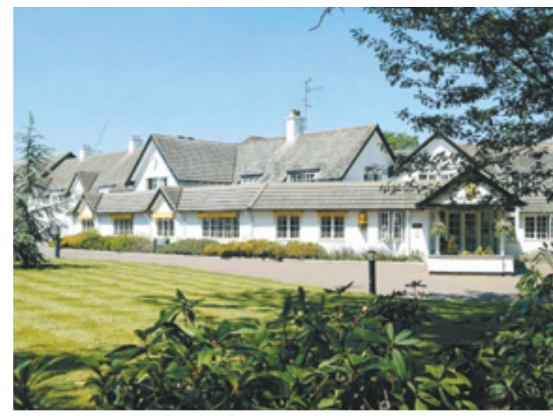
The Basingstoke Country Hotel, Hampshire.

On 12 July 2004, DSH acquired the Paramount Group, a chain of 13 four star hotels across Britain, with extensive banqueting, conference and leisure facilities, for an aggregate cash consideration of £215 million before expenses. This was financed through equity and mezzanine finance subscribed by clients of Shore Capital and by senior debt, in the amount of £177m, provided by Anglo Irish Bank. At the same time, the Company raised £22 million through a placing by Shore Capital of 22 million Ordinary Shares at £1 per share and the Company subscribed for £21.7m of units in DSH. On 17 December 2004, the Company raised £13.25m from investors and subscribed for a further £10.6m of units in DSH. These units comprise equity in DSH and deep discount bonds issued by a wholly-owned subsidiary of DSH.